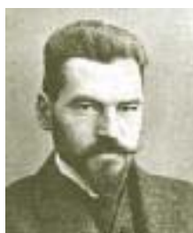
Marian Smoluchowski (1872–1917)

The year 1905 was truly a miracle year, annus mirabilis , in theoretical physics. Albert Einstein published four important papers that year: Two papers laying foundations for the Special Theory of Relativity, one explaining the photoelectric effect that would win Einstein the 1921 Nobel Prize in physics, and one explaining the mechanism of Brownian motion 1 . An independent explanation of this last phenomenon was published the following year by a Polish physicist Marian Smoluchowski 2 . An explanation of the origin and properties of Brownian motion was a solution to a nearly 80 years old puzzle, a remarkable feat, but nobody expected it to be a major breakthrough that would reshape the whole physics. This was, however, the case and we will try to explain why.