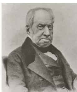
Robert Brown (1773–1858)

Brownian motion takes its name after a Scottish botanist, Robert Brown. Brown was a highly respected man in his time, not, however, for the discovery that he is now famous for, but for his classification of the plants of the New World. It was during this research that Brown noticed in 1827 that pollen in water suspension which he examined in his microscope displayed a very rapid, highly irregular, zigzag motion. Such motions had been observed even prior to Brown, but only in organic molecules, and their origin was delegated to some mysterious “vital force” characteristic of living matter. Brown was not satisfied with this explanation, which could possibly fit the living pollen. Instead, he noticed that an identical motion was displayed not only by living pollen, but also by dead pollen and by fine inorganic particles.