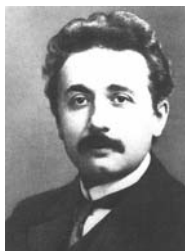
Albert Einstein (1879–1955)

Incidentally, Brown used pulverized fragments of an Egyptian sphinx in his experiments, which did not influence the results, but nicely demonstrates the intellectual climate of the time. In conclusion, this motion must have had a physical origin. But which? Brown, limited by his laboratory equipment, was only able to show that this motion was not caused by currents (flows) in the liquid, nor by convection, nor by the evaporation of the solvent.